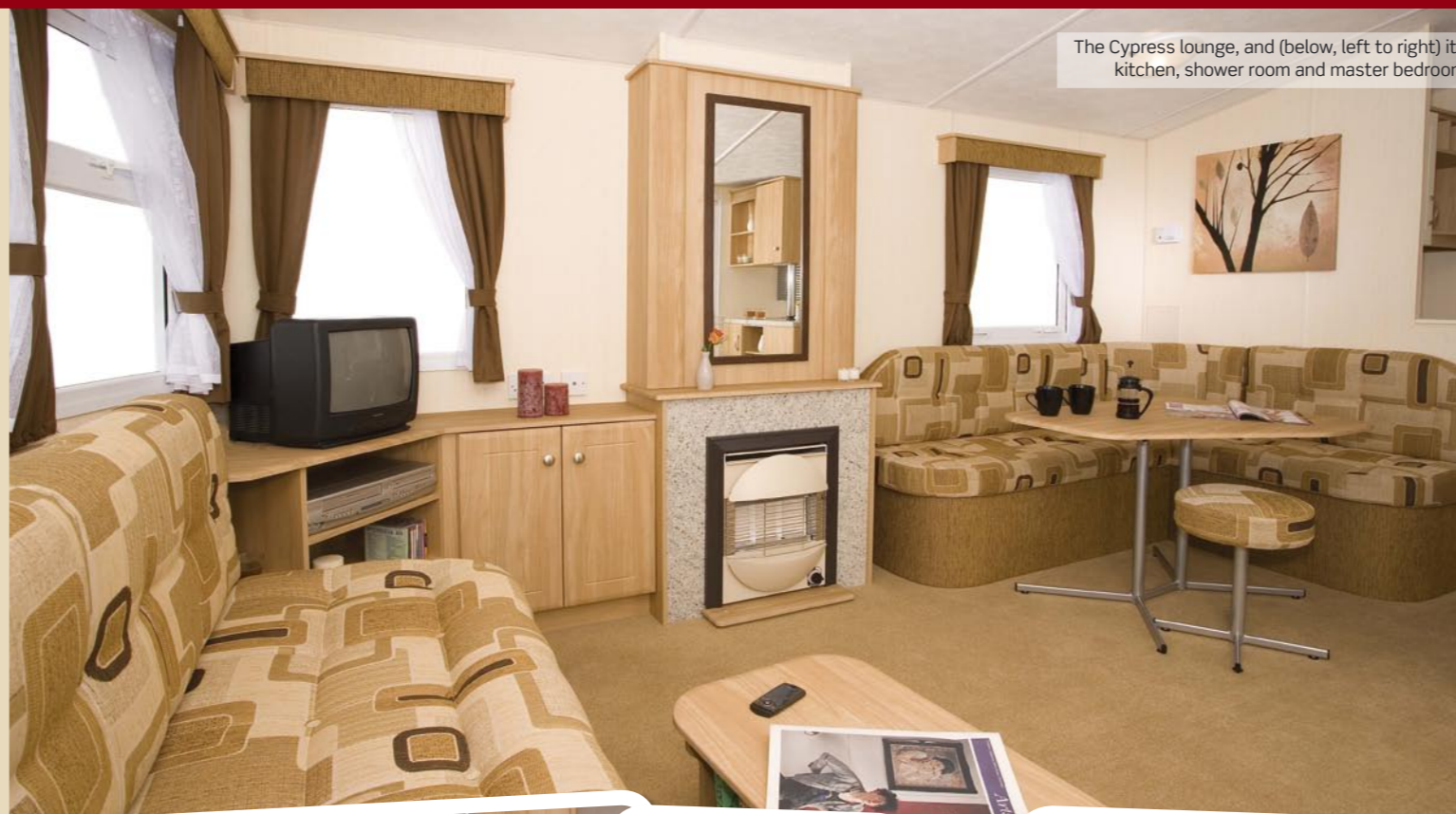
The Cypress lounge, and (below, left to right) its kitchen, shower room and master bedroom

To go up in the world you will have to pay, item by item. The basic model has, for instance, 30mm insulation in the walls, but you can improve on that for an extra charge (never skimp on insulation, sez I). You can have a metal action fold-out bed in the lounge, gas central heating, uPVC double glazed windows and door(s), most of what you would like for greater comfort. So you piece together your own model, or your park may have made those decisions already for you. This does add to the price but gives you a choice.