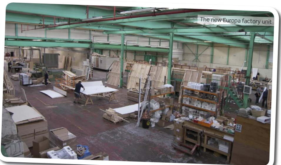
The new Europa factory unit

Thirdly, there is the opportunity to train the workforce from the ground up. Some are school leavers receiving the